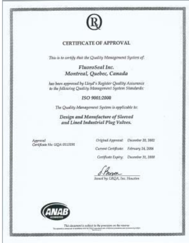
ISO 9001:2000 Certificate

FluoroSeal® DIN Sleeved Plug Valves possess all of the best design features presently available in a non-lubricated valve. They are inspected throughout the full manufacturing process from foundry to final assembly and packaging to assure high quality and consistency in every unit.